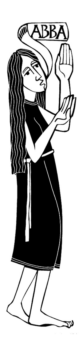
St. Barnabas' Episcopal Church Serving our community, the world, and each other through the love of Jesus Christ

facebook.com/StBarnabasEpiscopal Instagram: @stbarnabasannandale st-barnabaschurch.org • 703-941-2922