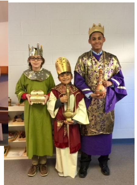
Mardi Gras Fun Saturday, February 10, 2018