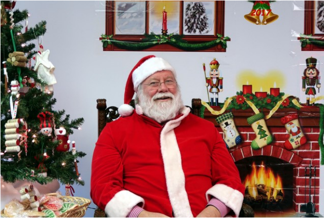
Afternoon with Santa Sunday, December 9, 2018