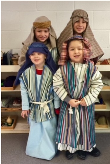
Epiphany Pageant – Sunday, January 7, 2018