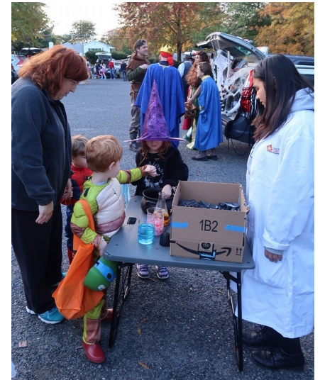
Above: More Trunk 'n' Treat fun!