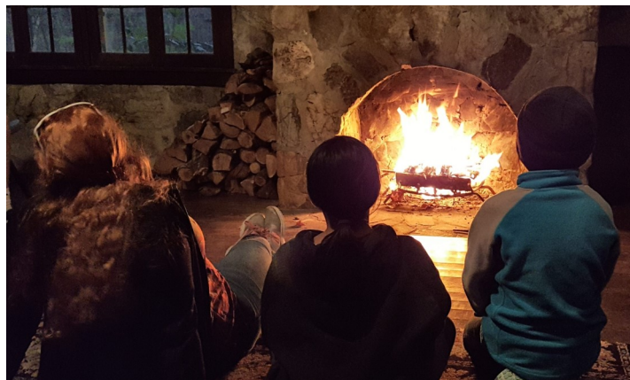
Photo right: A Calm, Chilly Evening by the Fire