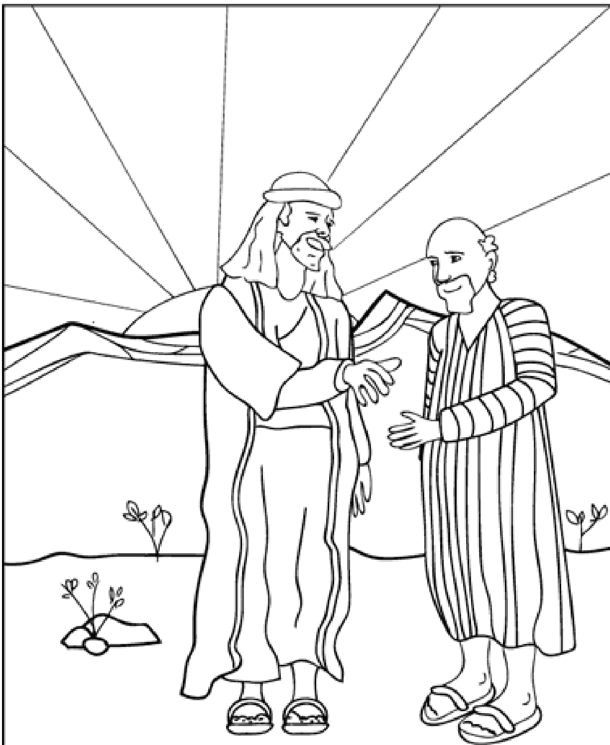
Barnabas Welcomes Saul

Copyright © 2011, BibleWise. All Rights Reserved. Drawing by Kathryn Wojno .