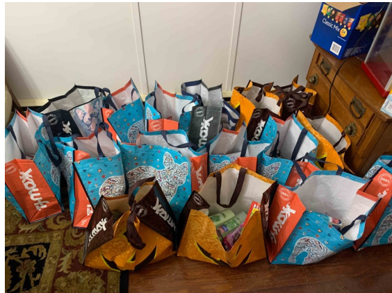
Above left and right: 24 “Hygiene Bags” packed by the Youth; they are being donated to Afghan refugees in our area.