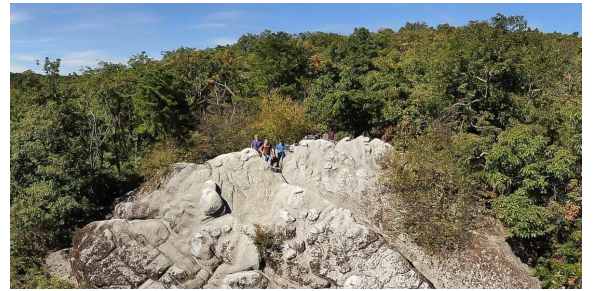
Above: Our group on North Mountain!