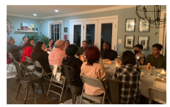
Rite 13 Dinner - A time of preparation and celebration