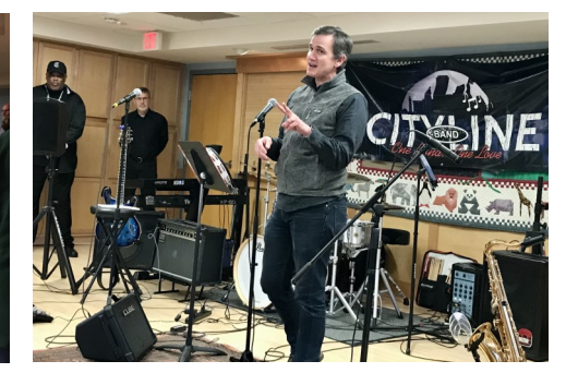
St. Barnabas' is grateful for the generosity of St. Barnabasians and friends who raised more than $2,000 for teh Bishop Walker School through this Jazz Café.