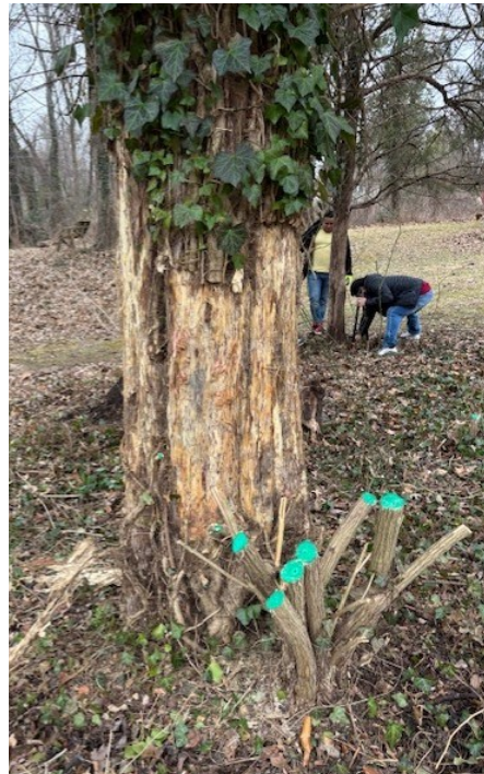
Bush Honeysuckle (foreground) with cut stems painted with herbicide to kill the roots.

All participants agreed that the event was a plus for both organizations, and we hope to be able to host the workers and benefit from their energy in the future.