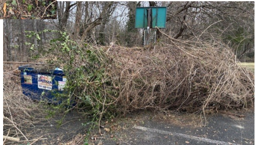
Our overwhelmed dumpster after the training concluded.