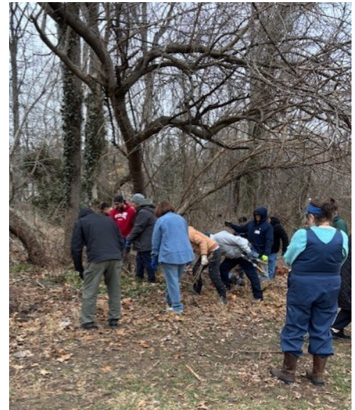
Removing vines from trees.